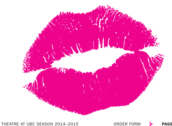
All prices include tax & service charge